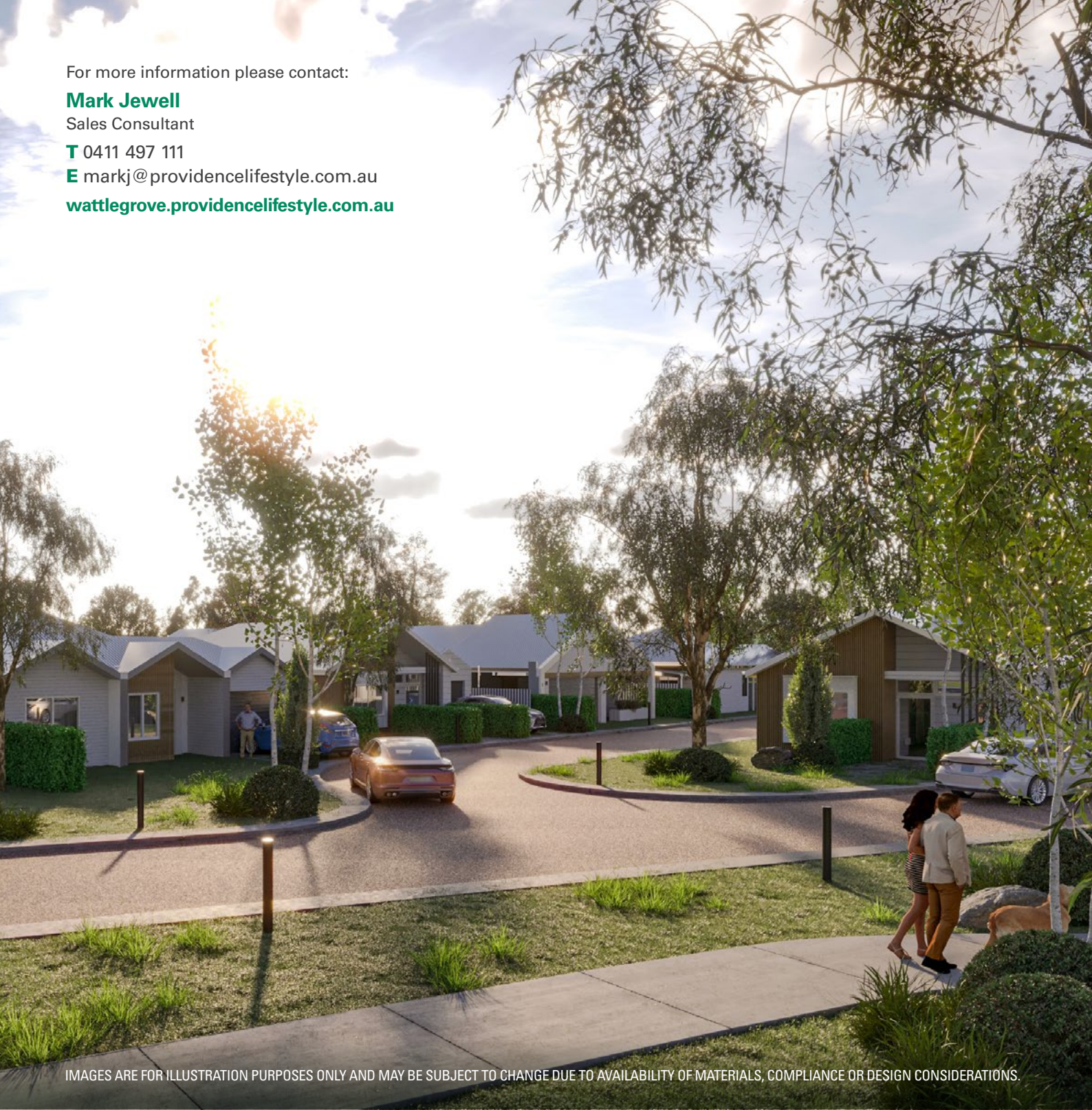
IMAGES ARE FOR ILLUSTRATION PURPOSES ONLY AND MAY BE SUBJECT TO CHANGE DUE TO AVAILABILITY OF MATERIALS, COMPLIANCE OR DESIGN CONSIDERATIONS.